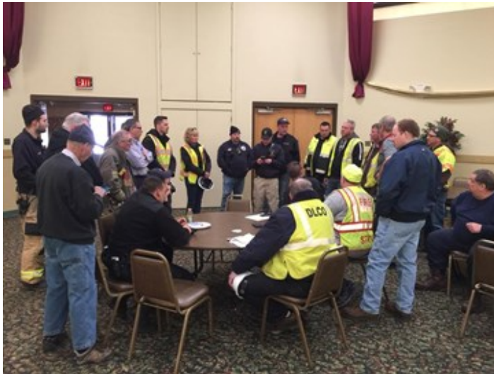
Above: Workers representing utility companies, local government, the Red Cross, and other organizations gather in Olympia Hall to coordinate their relief efforts.

On Holy Saturday morning, the Presentation of Christ Church of East Pittsburgh offered emergency assistance to 33 families that were displaced from supportive housing on Electric Ave. (near the Church) after a portion of US Route 30 collapsed, resulting in the destruction of several buildings. The Philoptochos worked with the Red Cross to host the residents in the parish community center until they were relocated to hotels where they remain indefinitely. The Philoptochos continues to support these neighbors, and has raised nearly $15,000 from sources all over Western Pennsylvania. In consultation with the Allegheny County Health and Human Services Department, distribution of resources began in May and is planned through Christmas.